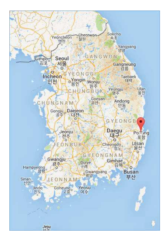
Figure 1. Study area map showing tidal gauge stations located in the South Korea and inset shows location of Pohang tidal guage station.